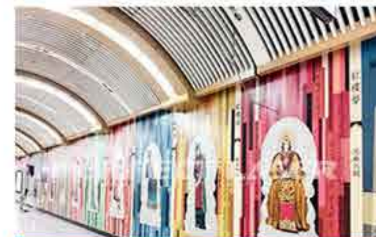
art experience museum