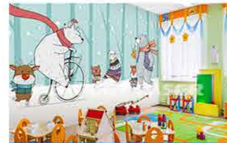
cultural and educational