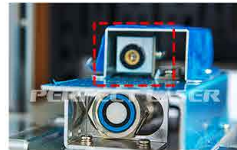
Red Light Pointer